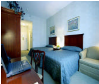
Two Double Beds