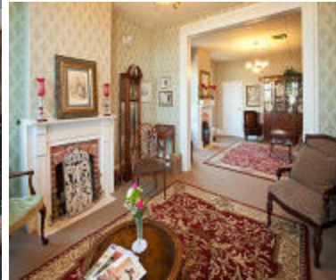
Restored Historic Home