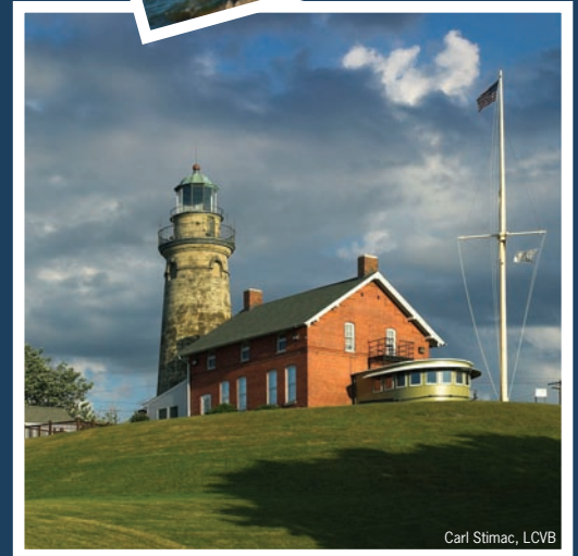
Carl Stimac, LCVB