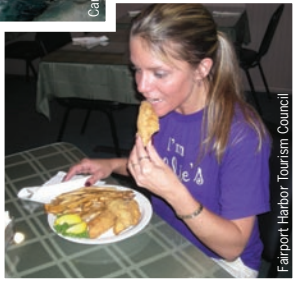
Fairport Harbor Tourism Council